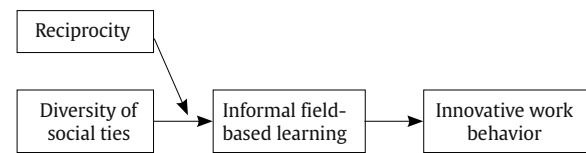
Figure 1. Theoretical Model.

Hypothesis 3. The reciprocity of an employee's social ties moderates the relationship of diversity of social ties on innovative work behavior such that the indirect effect through informal field-based learning is stronger at higher levels of reciprocity.