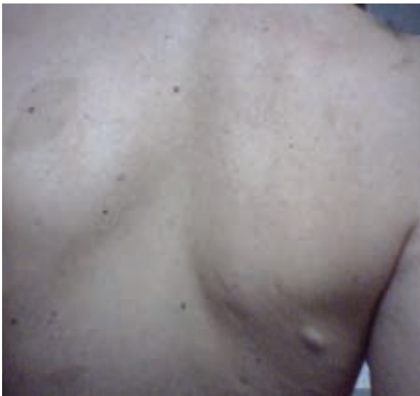
Fig. 1: Skin findings in a brother of the neurofibromatosis patient.