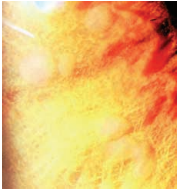
Fig. 3: Lisch nodules in a brother of the neurofibromatosis patient.