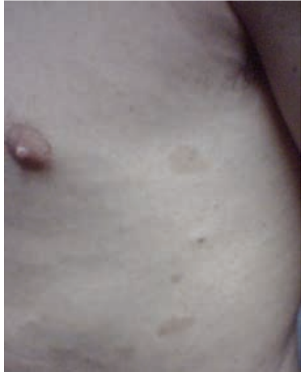
Fig. 2: Skin findings in a brother of the neurofibromatosis patient.

Neurofibromatosis can cause the following eye conditions: optic nerve glioma (20%) and other neural tumours, Lisch nodules (fig. 3), nevus corioides, uvea ectropion, prominence of corneal nerves, sphenoorbital encephalocele, retinal astrocytomas, skin tumors in eyelids, hemiatrophy of the face and congenital glaucoma, which is unilateral and rare; the angle can be occluded by deve-