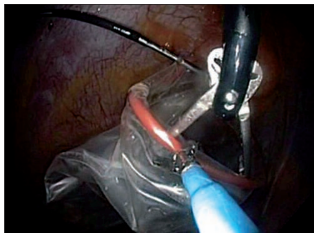
Fig. 4. Endoscopic instrument, "mouse-toothed" forceps, taking the edge of extraction bag.

came clearly visible inside the vagina and, with the help of a pair of Köcher forceps, is completely removed and closed the vaginal incision with two absorbable sutures. The operation lasted 110 minutes in all. There were no postoperative complications, and the patient was discharged in 48 hours. Histological examination showed a liver non-typical adenoma, without malignant cells.