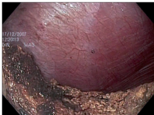
Fig. 3. Endoscopic view of bed of liver resection.

With a "mouse-toothed" forceps (Medi Globe GmbH, Achenmüle, Germany) that was slipped through the working channel of the videogastroscope (Fig. 4), the plastic bag containing the en bloc resection was gripped and slowly retracted until it had entered the vaginal trocar about 4-5 cm. Under laparoscopic visual monitoring, the videogastroscope, the forceps holding the bag and the vaginal trocar were removed en bloc , until the bag be-