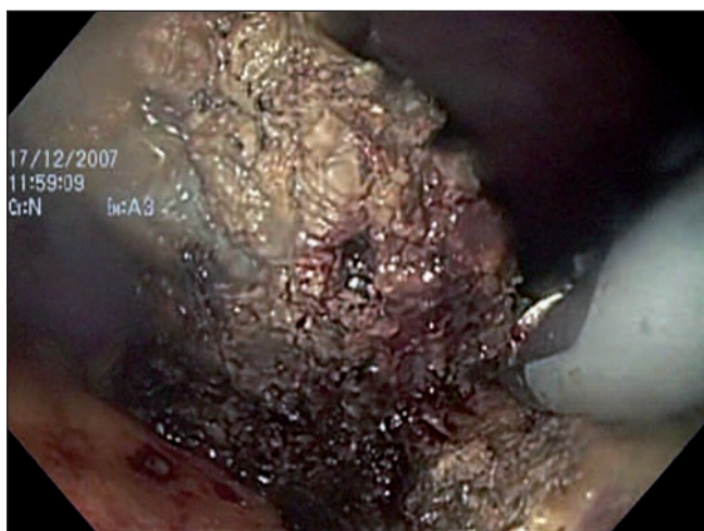
Fig. 2. Liver parenchymal transection with harmonic scalpel. Endoscopic view.

We began to dissect the hilum of the gallbladder, the omental and peritoneal adhesions, and the cystic duct and artery, which were sealed with clips and sectioned afterwards. The cholecystectomy was performed from the hilum to the fundus with electrocoagulation. En bloc resection was made with a wide partial resection of segment V including the tumour seen in radiological explorations. Liver parenchymal transection was performed using harmonic scalpel (Ethicon Endo-Surgery, USA) (Fig. 2) and radiofrequency tissular sealing (Tissuelink Medical, Dover, USA). The liver resection bed was inspected to ensure there was no hemorrhage or leakage of bile (Fig. 3). During this entire surgical time the videogastroscope kept shifting its position and angle in order to get a view that would make it possible to make liver transection, dissect, clip, and remove the liver and gallbladder. Liver resection was made with laparoscopic