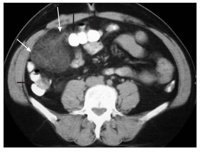
Fig. 2. Axial not enhanced CT image after oral contrast shows the relationship between colon (black arrows) and the omental infarction (white arrows). The infarct is located medial to the ascendant colon and slightly anterior to the transverse colon.