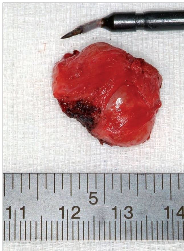
Fig. 2. Resected tailgut cyst showing the multicystic structure.

A 55-year-old female with a 24-month history of recurrent anal fistula and abscesses was admitted. Inspection and digital rectal examination revealed a tumor of the retrorectal space. Because of the multiple fistula-in-ano surgery a MR was indicated. A retrorectal tumor was suspected as the origin of the recurrent abscess formation and transanal endoscopic microsurgery was scheduled. The intervention and postoperative course were uneventful (Fig. 2). The histopathological examination of the cystic lesion confirmed a tailgut cyst.