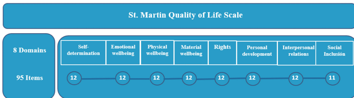
Figure 1. Structure of the San Martin Scale, showing the breakdown into eight domains and ninety-five items. The items are related in each dimension. All dimensions have 12 items, except for the social inclusion domain, which has 11 items. Own elaboration, based on the Scale Manual 26 (see Supplementary material).

When the San Martin Scale is administered to an individual, the responses that the individual has given per question (item) are obtained. By adding the responses for each item, the total direct scores for each dimension are obtained. Having the total direct scores of the dimensions, these are transformed into standard scores, using Table A in Annex A of the San Martin Scale manual 26 . Once having the standard scores for each dimension in on are obtained, they are summed up to obtain the total standard score. This total standard score is converted to a QoLI using Table