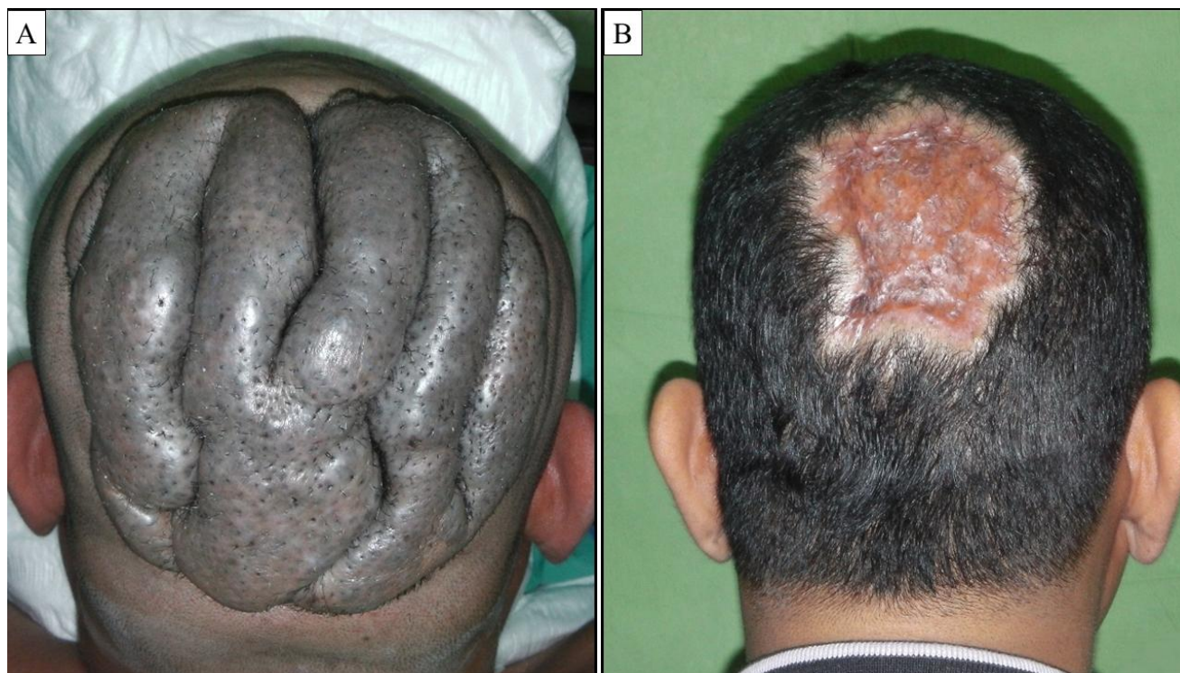
Figure 1: Clinical appearance of the lesion. (A) Pre-operative image showing a 16 cm x 12 cm hyperpigmented lesion with convoluted folds and furrows resembling cerebriform pattern over the vortex and occipital region. (B) One-year post excision and split thickness skin grafting over the scalp.

The pathophysiology of primary form remains unclear. However, secondary CVG can be caused by various disorders from local inflammatory disease of the scalp such as eczema, psoriasis, impetigo, erysipelas and pemphigus, to local neoplastic changes including melanocytic nevi, dermatofibromas, hamartomas and cylindroma. Systemic