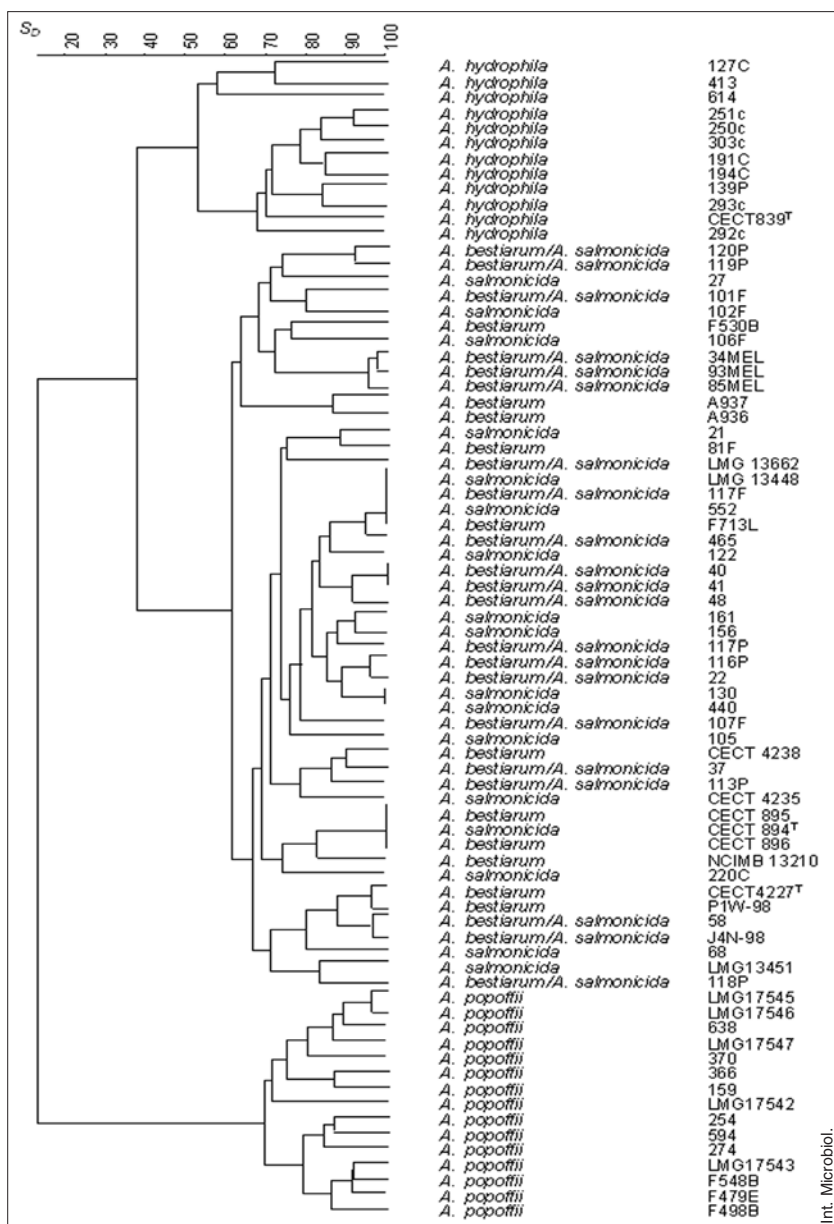
Fig. 2. S_0 /UPGMA cluster analysis based on the combined HinfI – CfoI and HinfI – TaqI restriction patterns of amplified 16S–23S ISR.

encompassed the strains of A. hydrophila (at a similarity level of 52%) and the other containing the strains of A. bestiarum , A. salmonicida , and A. bestiarum/A. salmonicida interspersed (at 62% profile similarity).