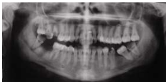
Fig. 1. Orthopantography.

A 36 year old male patient, allergic to penicillin, is admitted to the Maxillofacial and Oral Surgery Service with a right mandibular swelling since five days and fever up to 38°C. The physical exploration shows a septic mouth with important periodontal disease, great swelling at right submandibular level and edematous floor of the mouth. Blood test was showing 21.990 leukocytes in the blood test, the orthopantography reveal a periapical radiolucent image, important destructive of the 4.8 corone and a big amount of caries (fig.1) and the cervical CT scan showed images of emphysema of the soft tissues of the neck and floor of the mouth (fig.2). We proceed to its surgical desbridement under general anesthesia and, a treatment was established with 600mg endovenous of clindamicin every 6 hours and 240mg endovenous of gentamicin every 24 hour. In the culture Streptococcus intermedius resistant to clindamicin grew, consequently the treatment was changed for 1gr. Endovenous of vancomicina every 12 hours and 500gr. metronidazol every 24 hours delivered by mouth.