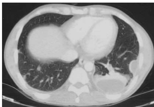
Fig. 4. Thoracic CT.