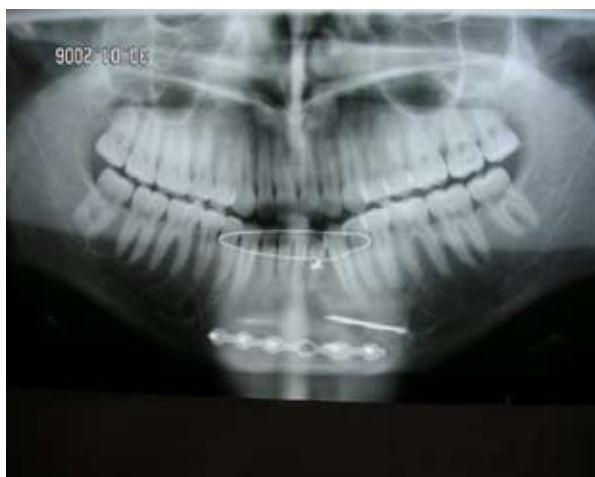
Fig. 1. Panoramic photograph demonstrate that the broken drill is located horizontally anterior to the mental foramen and superior to the left part of the mini plate. The bucco-lingual localization of the drill is still unclear.