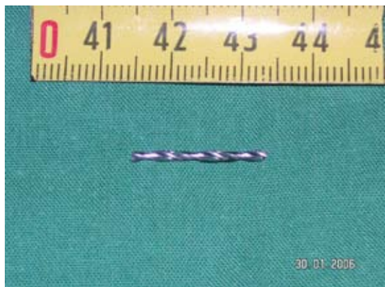
Fig. 3. The broken drill 19 mm long, after its removal.

Instrument breakage as an operative complication during ORIF, have been reported in orthopedic surgery, and drill breakage is the most common one (6). The fact that in many trauma centers the drills used for ORIF are re-used, may be in part, the reason for the high breakage rate. It is likely that re-used drills are at increased risk of failure. It was proposed that surgeons should ensure the single use by bending them at the end of each case to prevent re-use (7).