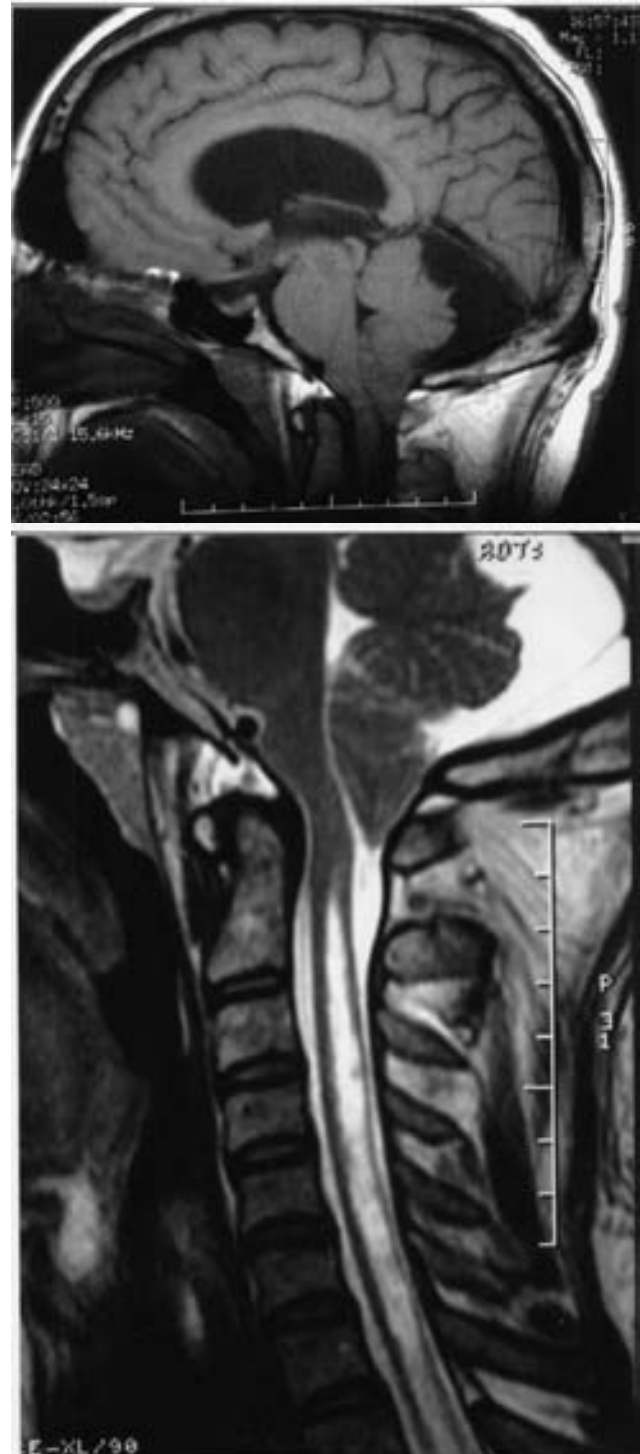
Figure 1. Preoperative MRI study of the patient showing: (a) acquired tonsillar herniation and a voluminous retrocerebellar arachnoid cyst, and (b) the syringomyelic cavity.

On 3 August 2004, an endoscopic third ventriculostomy was performed, after which the headaches markedly improved. Neuroimaging studies showed no changes in his posterior fossa cyst, cerebellar tonsil's location or syringomyelia. Clinically, the patient's condition seemed to be deteriora-