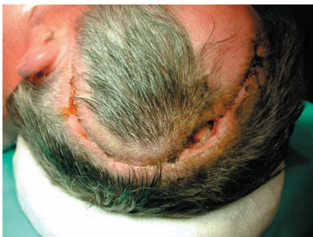
Figure 1. Wound dehiscence with purulent material discharge in the upper part of the incision (case number 5).

debridement, intraoperative bone sterilization, reposition of the bone flap and antibiotic irrigation through wash-in and wash-out drains in the same surgical procedure. All infections resolved and every patient saved his/her bone flap. Some technical aspects of this procedure are also discussed.