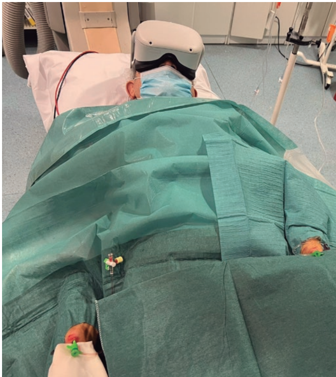
Figure 2. Real patient wearing virtual reality goggles during a chronic total coronary occlusion revascularization procedure using double radial artery access.

Secondary endpoints will be to assess a) changes to the maximum level of pain perceived by the patient during the procedure; b) differences in the need for intraoperative anxiolytic drug therapy or doses of anxiolytic drugs (midazolam or morphine chloride) administered during the procedure; and c) the overall satisfaction experienced with the VR goggles.