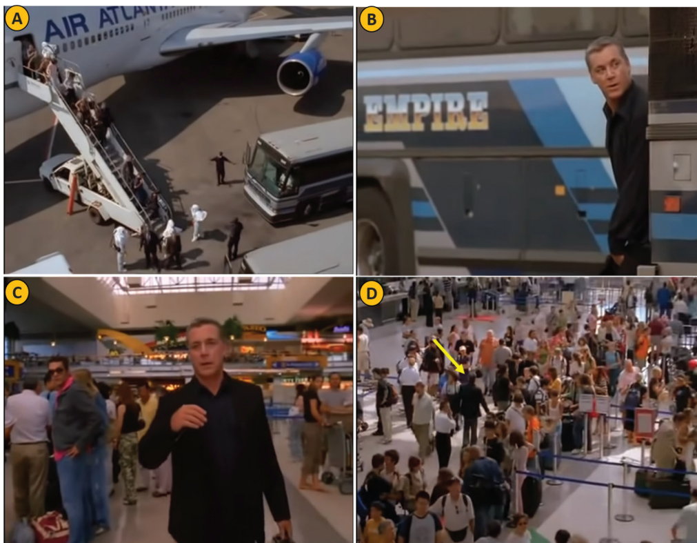
Photo 1. Initial actions to prevent contagion. A. Arrival of the flight from Australia with the index case deceased during the trip. The CDC keeps the crew members in safekeeping until the infectious disease is elucidated. B. Jack Hender escape. C. and D. Jack Hender spreads the disease by manifesting respiratory symptoms.

JEEL G. MOYA-ESPINOZA; JEEL MOYA-SALAZAR; HANS CONTRERAS-PULACHE