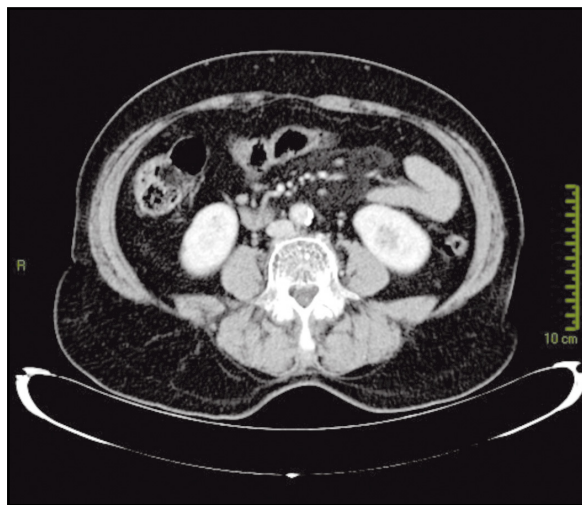
Figure 1. Abdominal CT scan showing area of panniculitis at the root of the mesentery