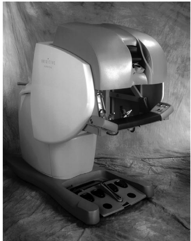
FIGURA 2. da Vinci™ System.