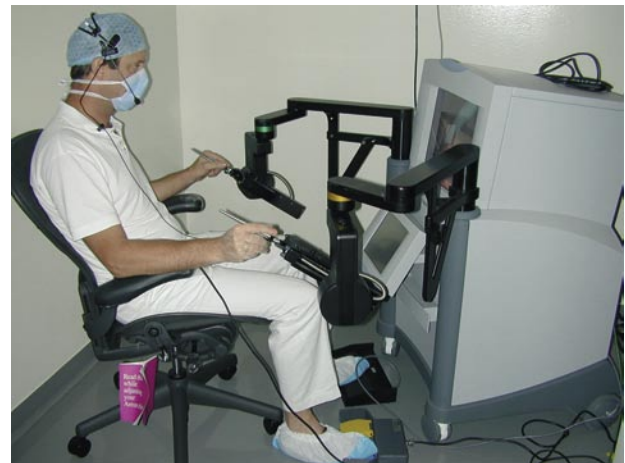
FIGURA 4. Zeus System.