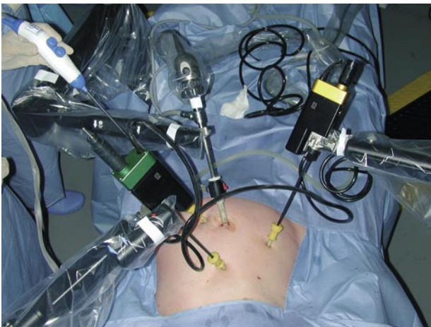
FIGURA 3. Zeus System.

5. Zeus Surgical System: A master console allows the surgeon to control three independent articulated arms positioned at the patient. One of them is an AESOP to hold the endoscope. The two other arms are similar and based on the same technology. This device provides six degrees of freedom. Although initially it was developed with a two dimensional viewing system, the final version was provided with a 3-D system (Figures 3 and 4). In 2001, Marescaux from Strasbourg performed the first and so far unique transatlantic surgery in history. He performed from New York, USA, an uneventful cholecystectomy on a patient in Strasbourg, France (21).