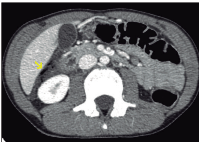
Fig. 1. Axial computed enhanced tomography scan of abdomen showing a small amount of free air bubbles (arrow) on the perihepatic and right anterior pararenal space adjacent to the retroperitoneal portion of the duodenum.

Isolated perforation of the duodenum is an extremely infrequent lesion as a result of horse-related blunt abdominal trauma in children (1). Less than ten pediatric cases could be accounted. Vast majority of patients with duodenal injuries have other concomitant intra-abdominal lesions (2,3). This entity is very difficult to diagnose and may be delayed especially when the retroperitoneal part is affected due to its subtle clinical characteristics resulting in significant morbidity and mortality.